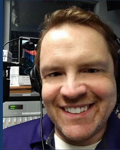
Commercial VO Reel