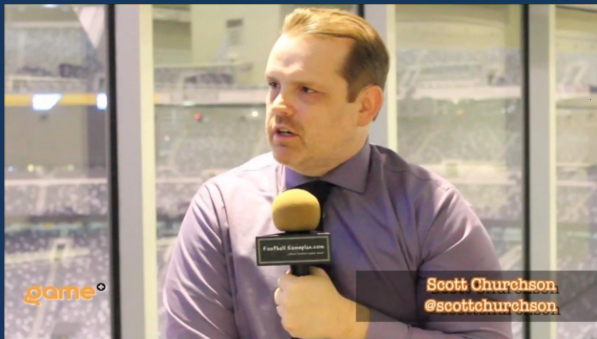
Sports Correspondent Reel